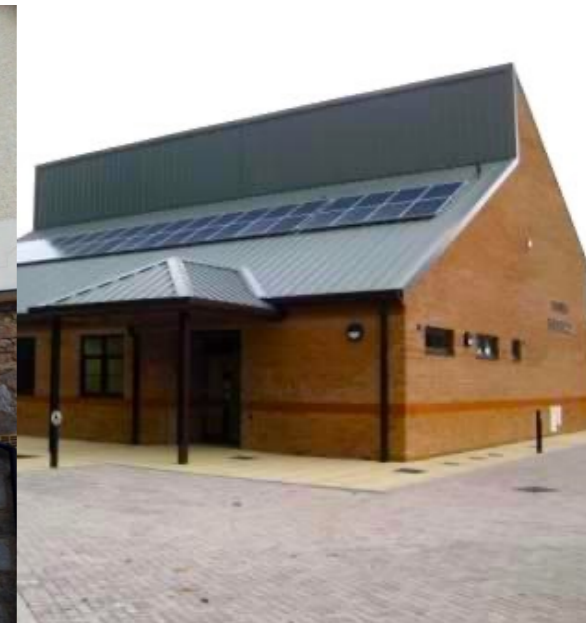
Thursby Parish Hall