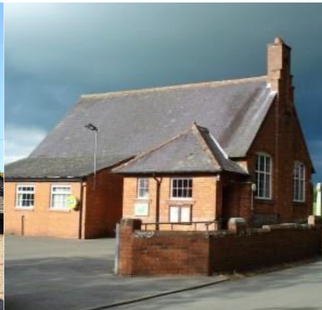
Scaleby Village Hall