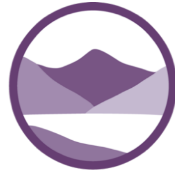
Lake District National Park