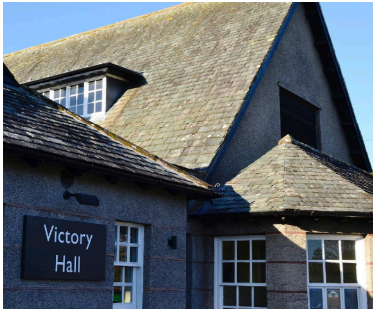
Dalston Victory Hall